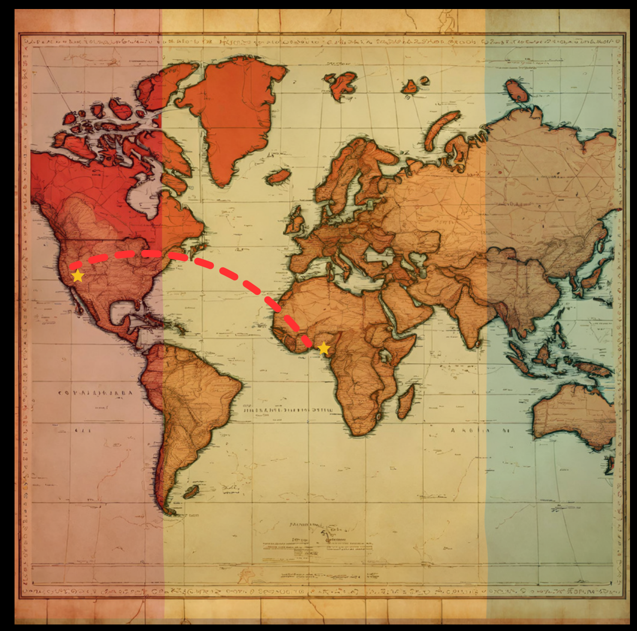
FROM GUINEA WEST AFRICA TO THE BAY AREA, CA